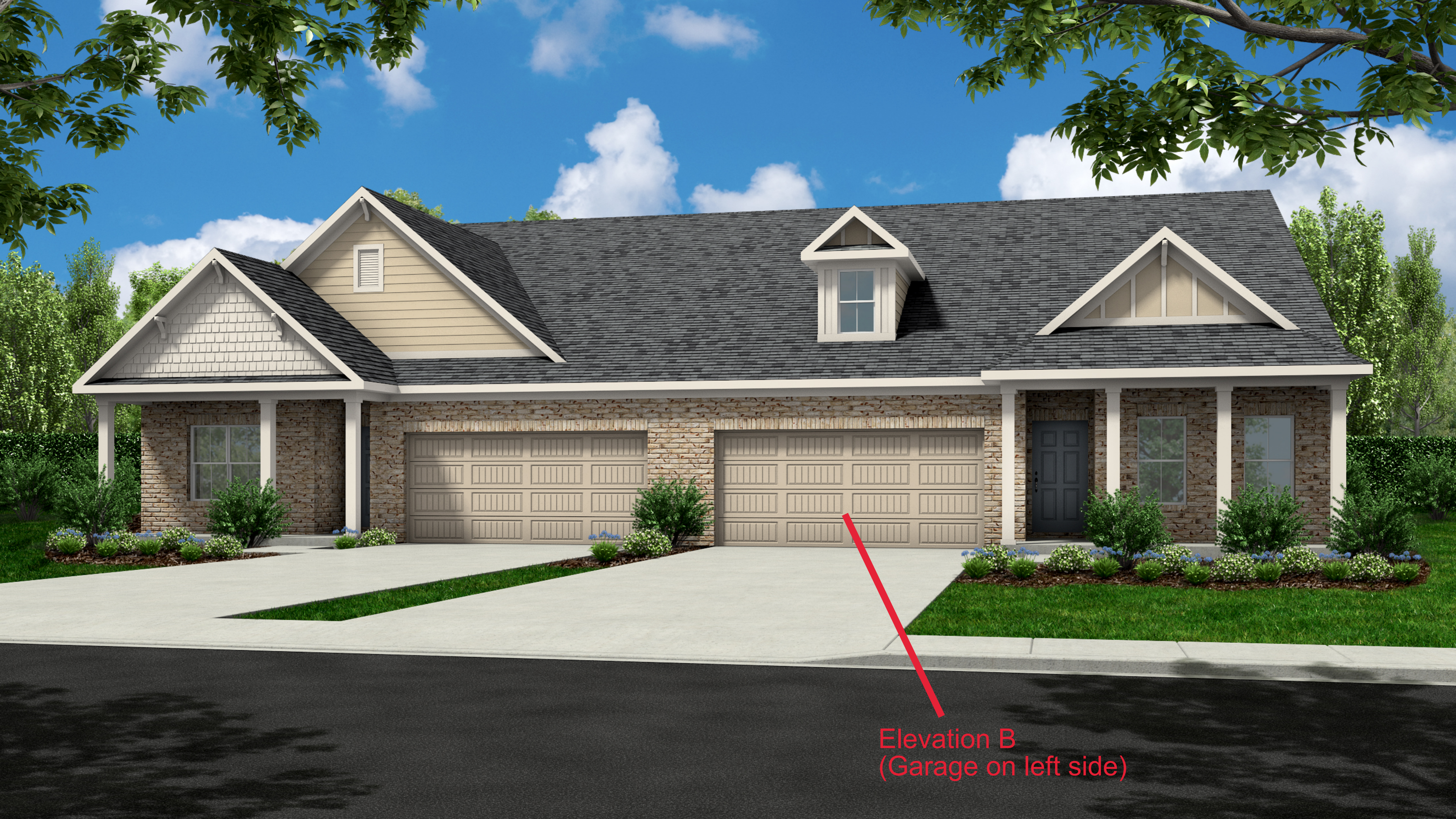
Elevation B (Garage on left side)